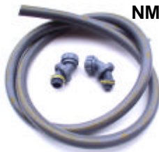
NM Kits (Hookup length of NMUA c/w connectors)